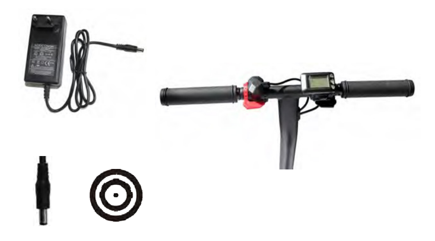
Plug the adapter into the charging port