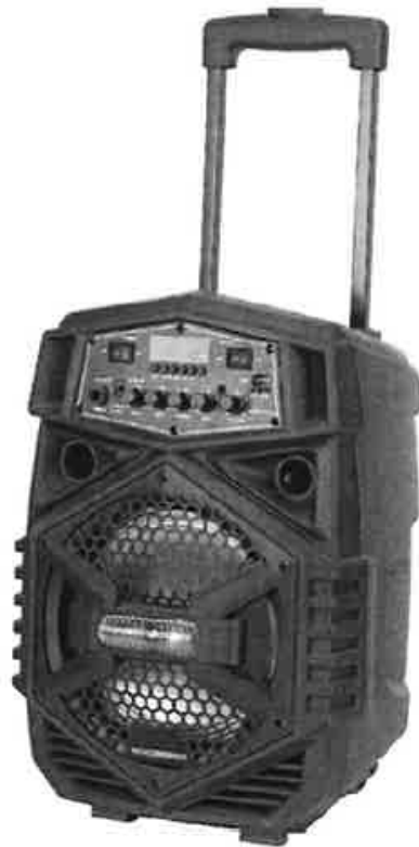
TSP-110 Portable BT Speaker System